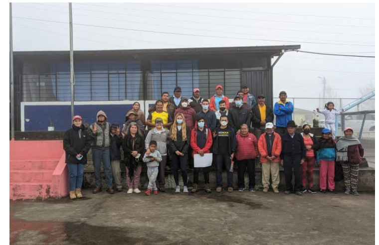
Water Source Development, Ecuador