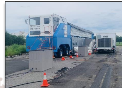
Heavy Vehicle Simulator