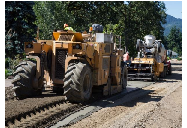
Full-Depth Reclamation Process